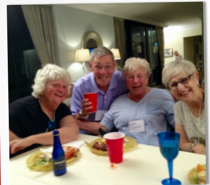
SAX HOSTED FRIDAY'S DINNER