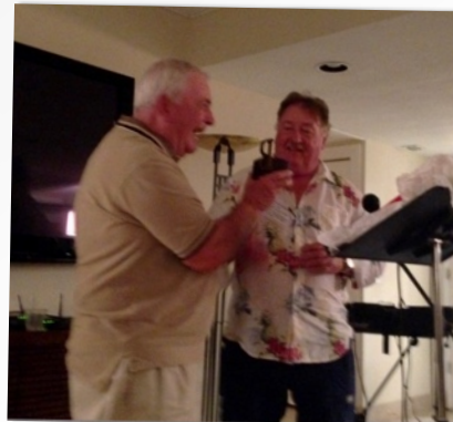
JIM'S SPECIAL THANK YOU GIFT