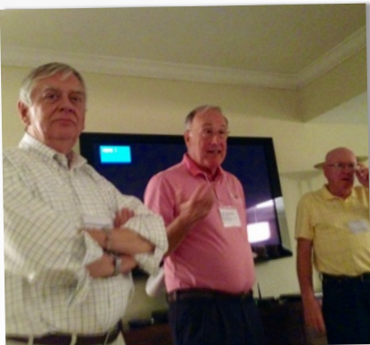
THE THREE MUSKETEERS