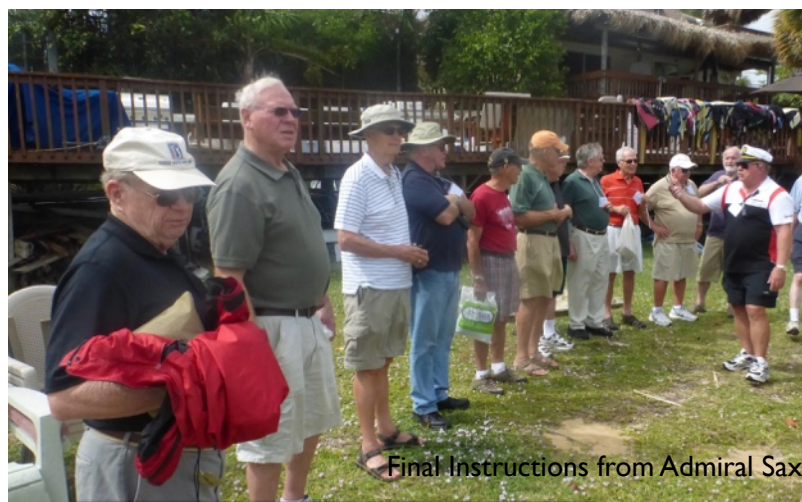
Final Instructions from Admiral Sax